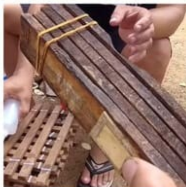
side view flattened double-sided tape on egg collector