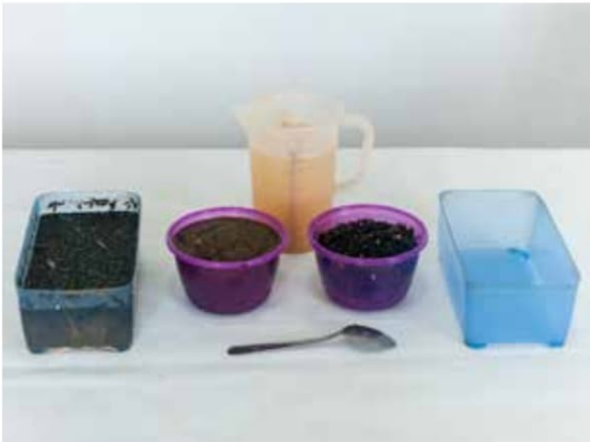
Ingredients of the attractant container (R1-9)

Very ideally, look for some container with a flat top surface & four little short legs somewhat like the blue box below. The space under the box, created by the four legs, will help with thermal balance. They'll keep the flies laying eggs on the spot we design for them.