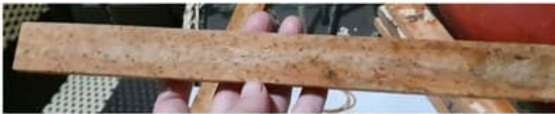
spacing in between about 0.8-1 mm

Some people use double-sided tape to space out the wood sticks. Although this material is relatively cheap, over time or many uses it tends to flatten down. So the fluffiness or the gap is closed, making it hard to get the flies to lay eggs there. Over time, you can see the tape flattened down. It looks something like this: