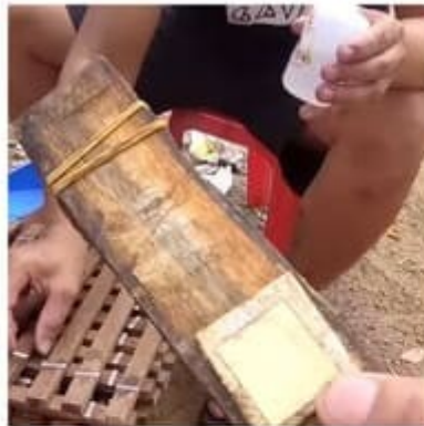
front view double-sided tape on egg collector

Some people use double-sided tape to space out the wood sticks. Although this material is relatively cheap, over time or many uses it tends to flatten down. So the fluffiness or the gap is closed, making it hard to get the flies to lay eggs there. Over time, you can see the tape flattened down. It looks something like this: