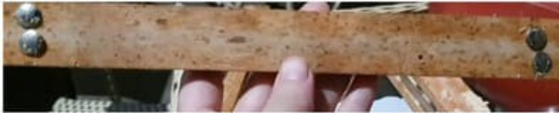
blank side of wood egg collector