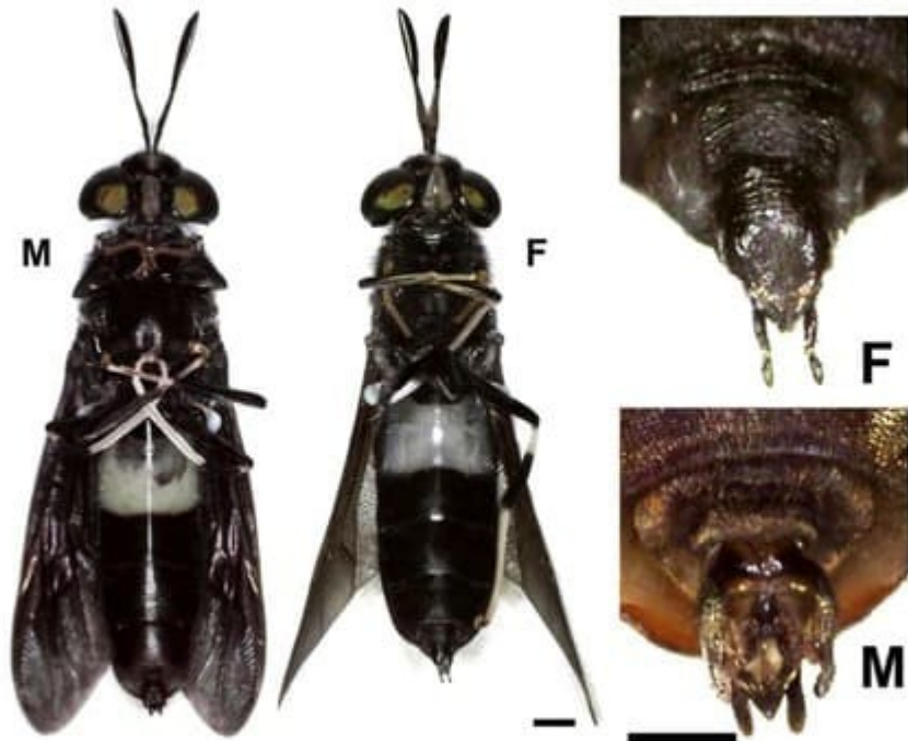
Fig. 1. Left, adult female (F) and male (M) black soldier flies ( Hermetia illucens ); right, magnified genitalia. Scale bars, 1 mm.